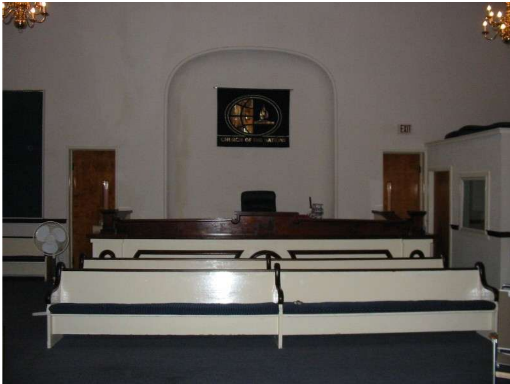
Note the high ceilings, chandeliers and overall great condition of the building. There is also a full basement.